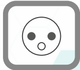
Type F Outlets